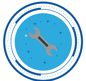
Flexible & Configurable